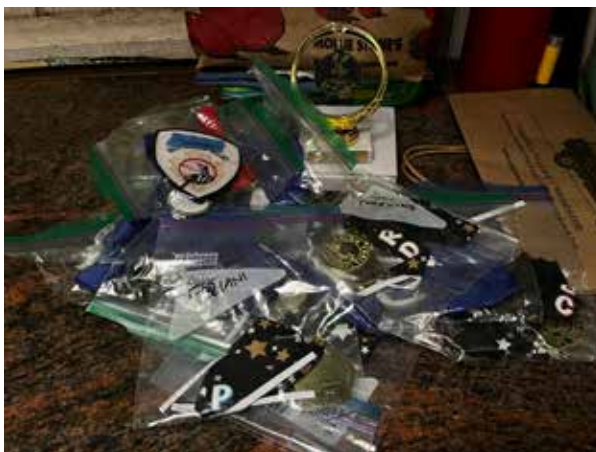
Awards in the KMA clubhouse